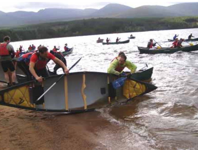
Left: Cairngorm Adventure Triathlon

2.4 The Cairngorms National Park is the largest National Park in the United Kingdom and has an international reputation for its landscape and wildlife. Many event organisers choose to hold events in the Park to take advantage of this stunning scenic backdrop. There are parts of the land within the Cairngorms National Park that are covered by national and international conservation designations, and event organisers should try to familiarise themselves with these areas and their particular sensitivities. For example, the mountain areas contain some of the most sensitive plants and animals that have adapted to live in this arctic-like climate, and the pinewoods are home to specialised plants and animals that are restricted to this habitat. The mountains also offer areas for quiet recreation which allow visitors to enjoy the wild qualities of this special place. Wherever practicable, it is best to hold events that use existing paths and tracks. This can help avoid damage to the environment. Equally, the Cairngorms National Park has areas that are well suited to holding spectacular and successful outdoor events that can bring participants and spectators closer to this wonderful environment. If well planned and managed, events need not conflict with the environment, residents, other users, or land managers.