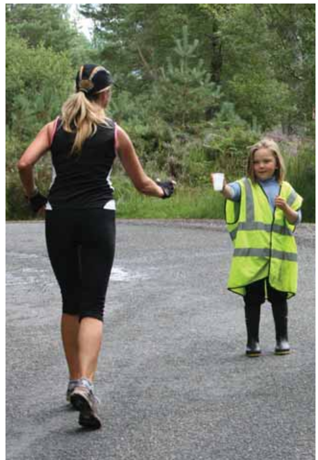
Left: Race marshalling, Nethy Bridge

such sites. The CNPA can also provide information and advice on how to avoid causing damage to other sensitive habitats. On SSSIs, land managers must obtain consent from SNH to carry out or permit certain operations – known as ‘operations requiring consent’ – that might damage the features of the site, and if the site is also a Natura site a further assessment may be required. It is therefore important that land managers are consulted in good time to allow them, if necessary, to discuss the issues involved with SNH.