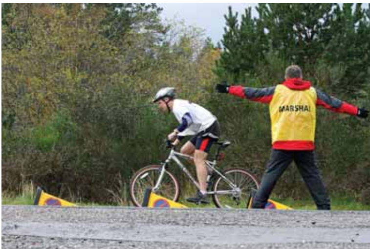
Left: The Cairngorm Charmer

It is good practice to survey participants and all interested parties, eg local residents, agencies and neighbouring land managers, after the restoration work is complete but soon enough so that everyone remembers the main elements of the day. Event organisers may wish to consider keeping a written note of issues throughout the process of planning to the actual day of the event so that these can be included. For larger events a meeting may help draw out what has been learnt from the staging of the event which will help in the future. A short report should be produced and circulated to all interested parties. It would be of great help and assistance if organisers sent a copy of all event reports to the CNPA for retention (email: outdooraccess@cairngorms.co.uk ). These reports can then be consulted by future event organisers.